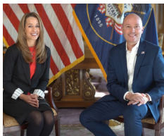
MLK Day Message Gov. and First Lady Cox