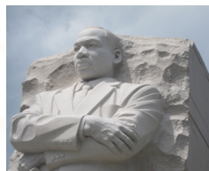
Virtual Tour of MLK Memorial