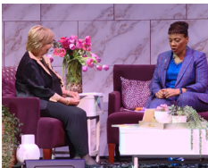
Dr. Bernice King's visit to Utah