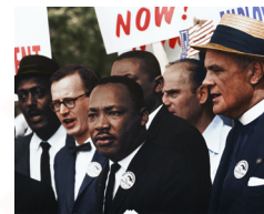
MLK's Speech in Selma, Alabama